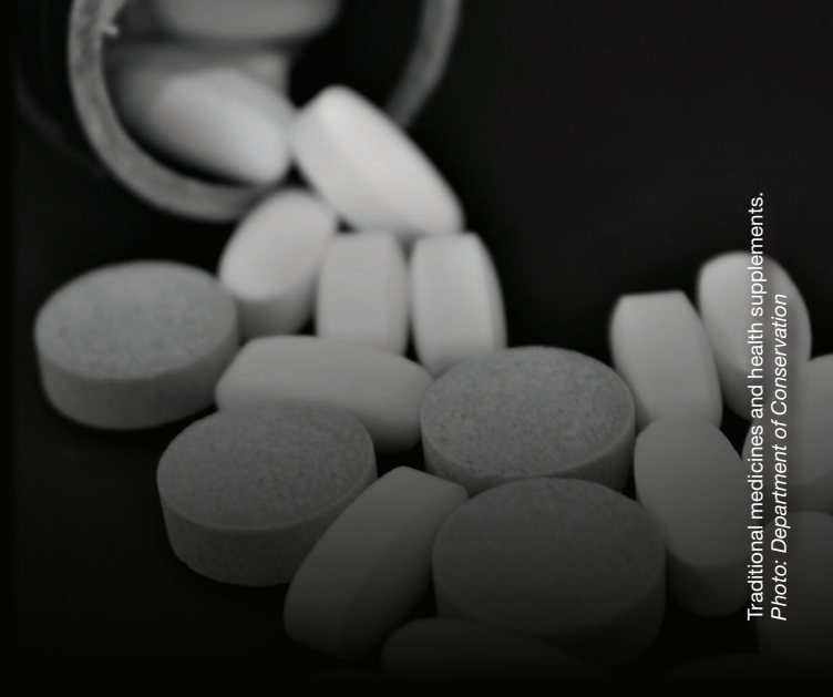
Traditional medicines and health supplements.

Items made from farmed products, those purchased from retailers overseas (including online) and inherited antiques are still covered by CITES. In New Zealand, stricter rules apply for importing personal and household items than in many other countries.