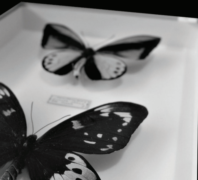
Butterfly ( Ornithoptera goliath ) taxidermy.

Many of the world's animals and plants are threatened by uncontrolled importing and exporting between countries. This is managed by the Convention on International Trade in Endangered Species (CITES). CITES is an international agreement that aims to ensure that the imports and exports of these species do not threaten their survival. Over 38,000 plants and animals are protected by CITES.