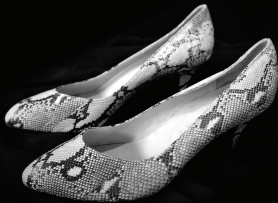
Heels made of reptile skin ( Pythonidae sp.).